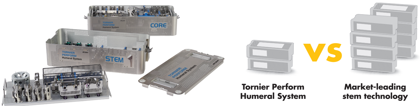
Tornier Perform Humeral System