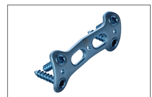
Darco MPJ Plate

Ortholoc with 3Di Technology Crosscheck Plating System