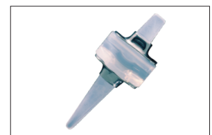
Swanson Flexible Hinge Toe