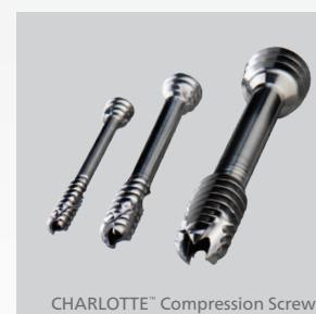
CHARLOTTE™ Compression Screws